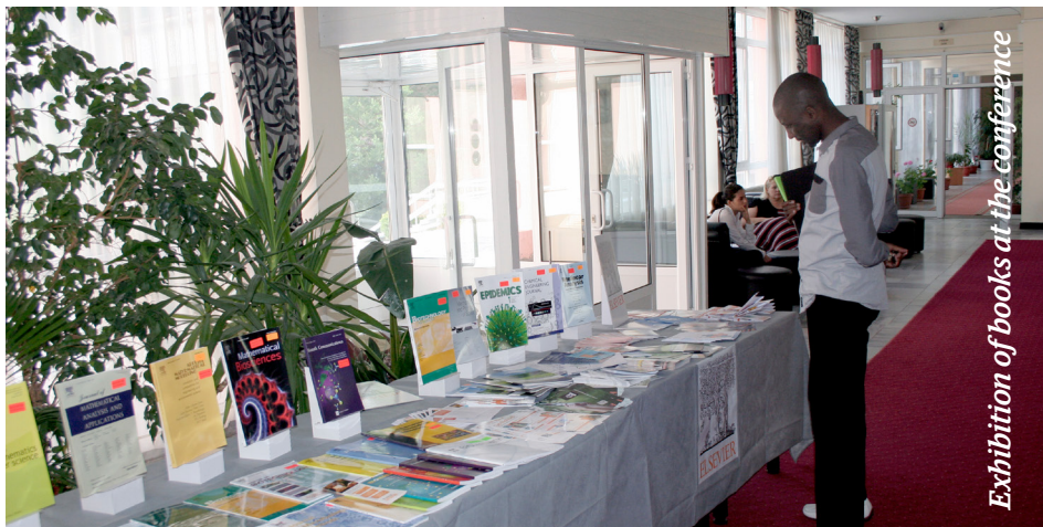
Exhibition of books at the conference

On June 15, 2015 was the Grand opening of the Annual international conference on mathematical methods and models in life sciences "Biomath 2015" at the SWU "Neofit Rilski" University Center "Bachinovo".