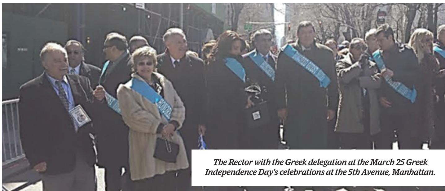
The Rector with the Greek delegation at the March 25 Greek Independence Day's celebrations at the 5th Avenue, Manhattan.

The Ionian University's extroversion and reflection of its worldwide academic presence promotes new challenging and close cooperation with the Greek community living abroad.