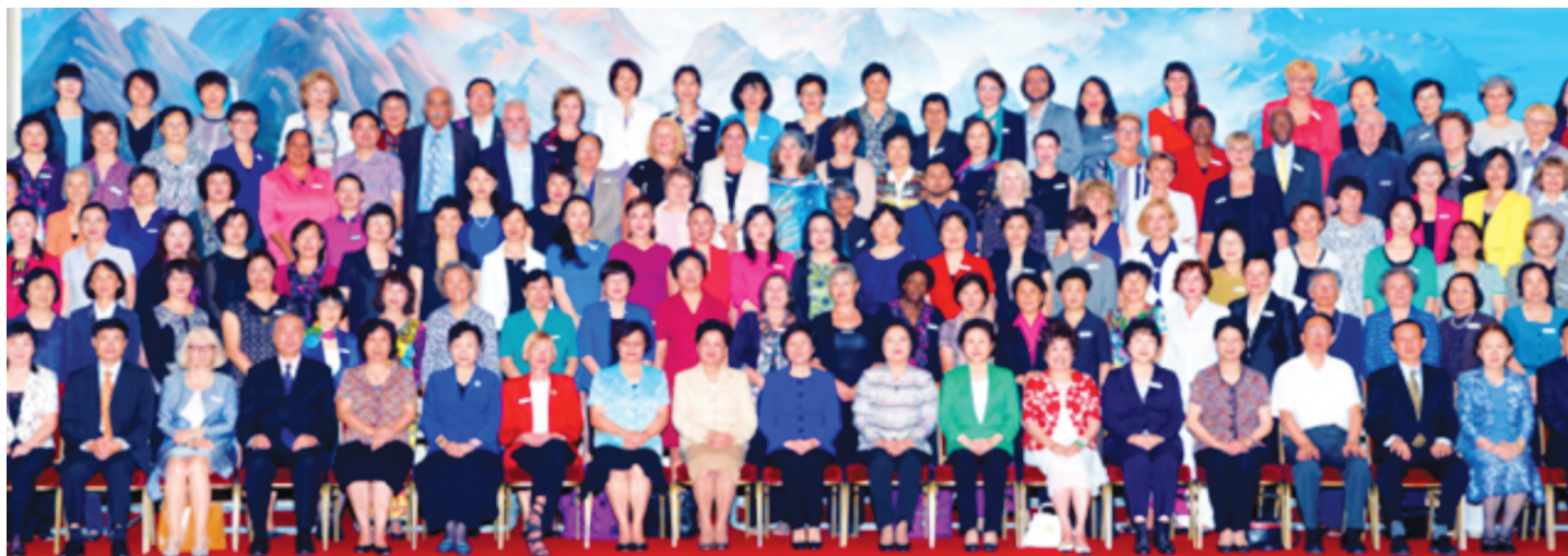
The "6th World Women University Presidents Forum" participant's photograph in China.