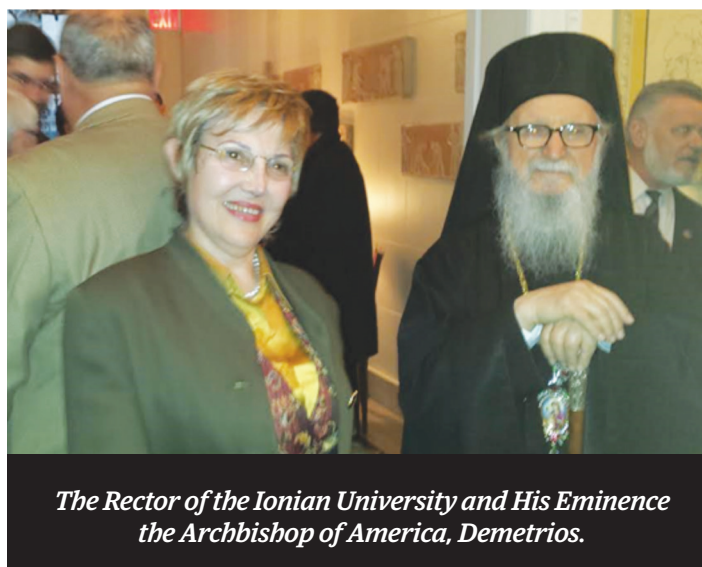
The Rector of the Ionian University and His Eminence the Archbishop of America, Demetrios.

Moreover, the Rotary Club of New York, one of the most