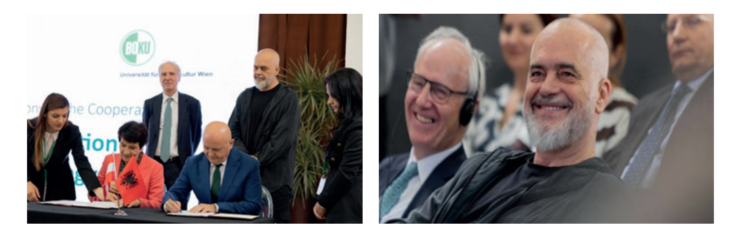
Launch of the 1st Level International Master in Albania: Open Innovation and Youth Entrepreneurship in the Mediterranean Green Sector.

The University of Agriculture in Tirana (Albania) hosted the launch event of the 1st Level International Master in "Open Innovation and Youth Entrepreneurship in the Mediterranean Green Sector" on 12 June 2024. This new academic programme is a significant investment in the skills of young people, to drive the process of building innovation ecosystems and support a greener and more competitive transition of local economic systems in Albania.